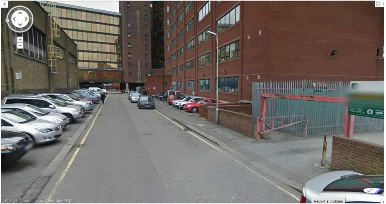
Proposed smoking shelter location 3