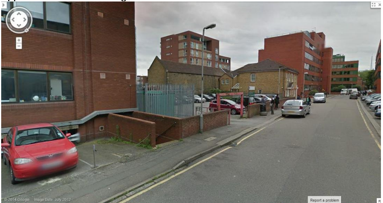
Proposed smoking shelter location 1